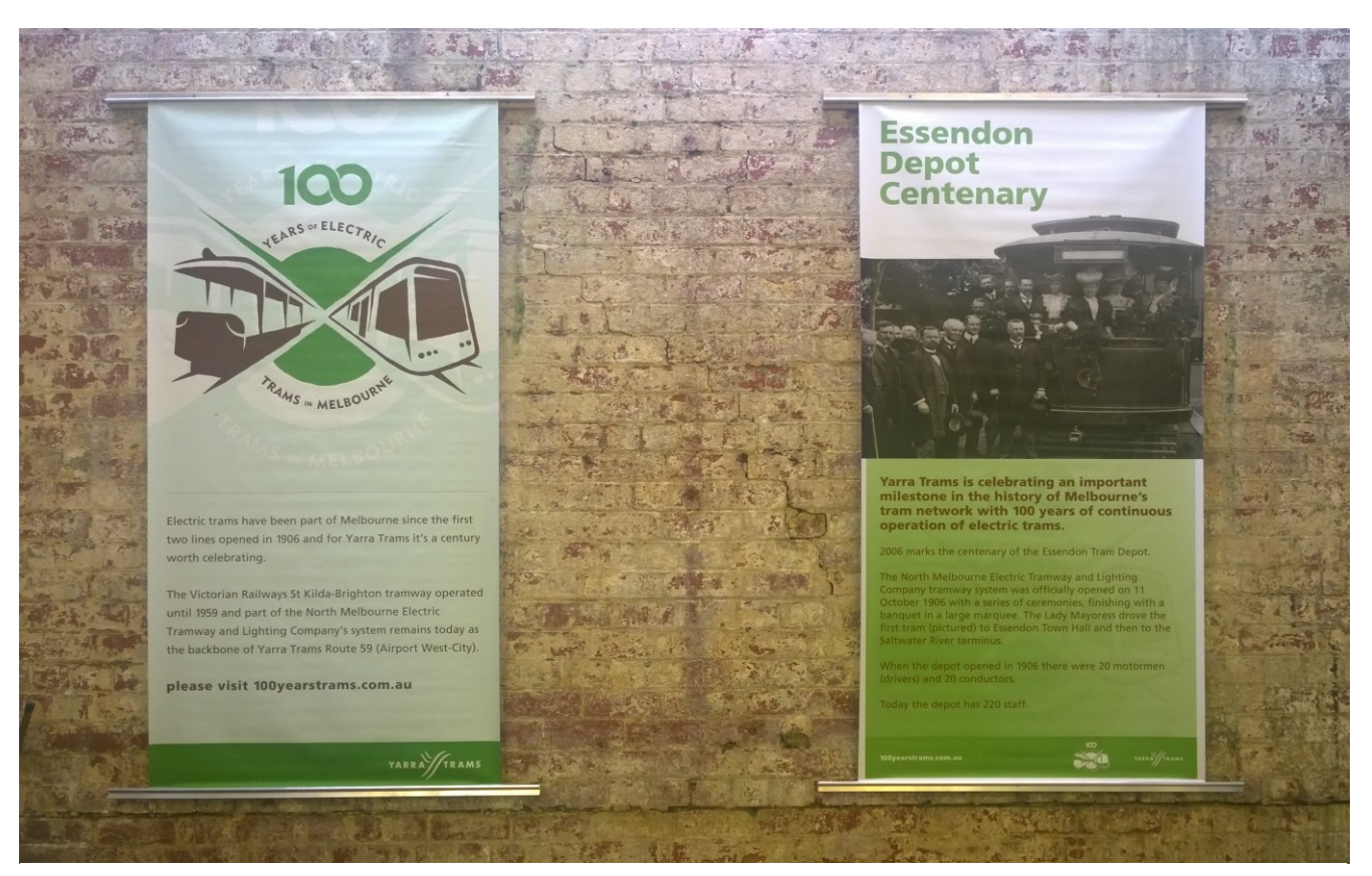
Wall hangings celebrating the centenary of Essendon Depot and electric trams in Melbourne in 2006, donated by Yarra Trams, now hanging in one of the alcoves in the main display room at the museum.