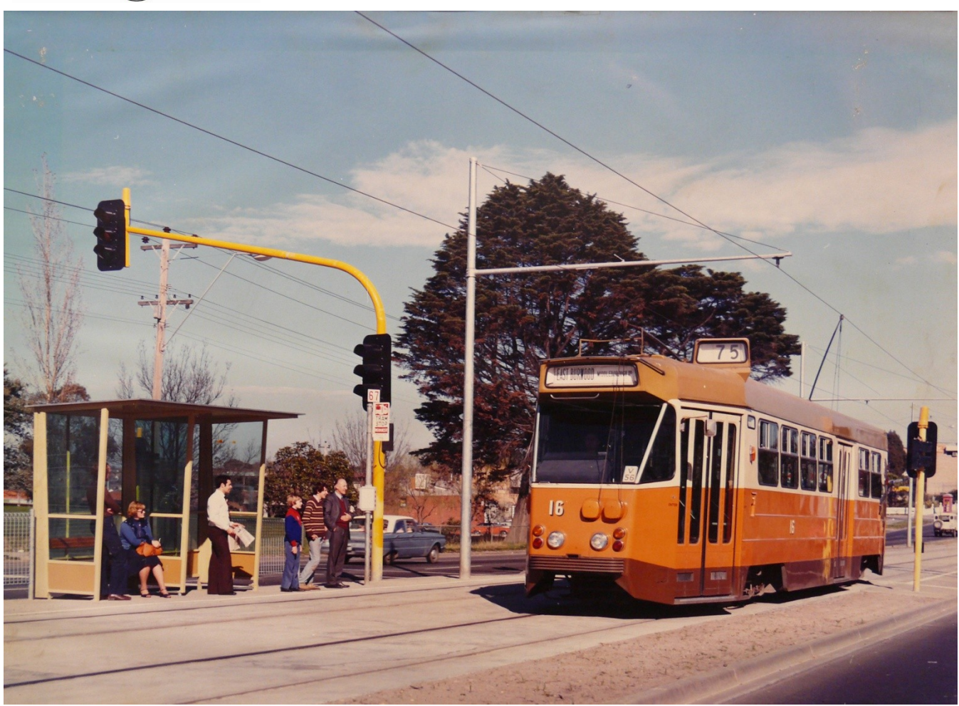
Z 16 outward bound on Burwood Highway on its way to the East Burwood terminus at Middleborough Road shortly after opening of the route 75 extension in 1978. This tram was one of those partially funded by the Whitlam Federal Government's Urban Public Transport Assistance Scheme.

Journal of the Friends of Hawthorn Tram Depot