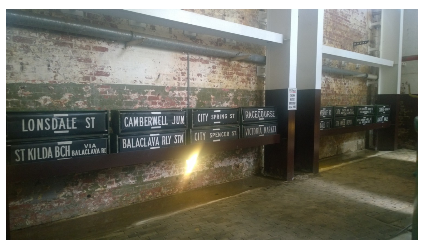
The display of W class destination boxes at the rear of the depot. A gap in the display of fifteen boxes was filled with the sixteenth destination box on 22 November 2014.