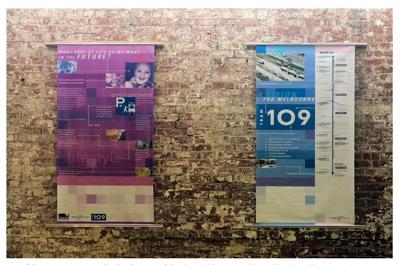
Wall hangings promoting the development of the Tram 109 project, donated by Yarra Trams, now hanging in one of the alcoves in the main display room at the museum.