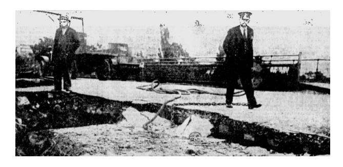
Damage to the road surface on the Richmond side of the Wallen Road Bridge - 3 December 1934.

This bridge was built in 1881 to a utilitarian design in a combination of cast and wrought iron, connecting Hawthorn with Richmond. It was widened and strengthened in 1916 to carry the double track tramway of the Hawthorn Tramways Trust across the Yarra River. Now, it was under severe threat of collapse, from the battering the bridge piers received from the flood and its debris.