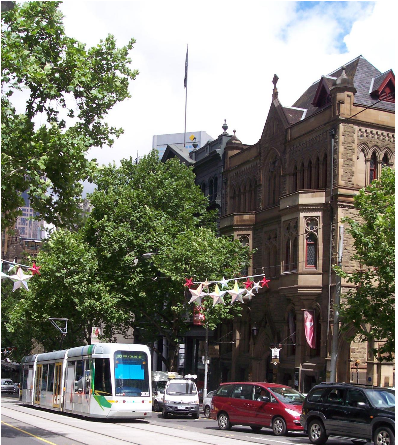
Citadis under Christmas decorations in a busy tree-lined Collins Street

Georges was a pillar of the retail establishment in Melbourne, founded in the 1860s, moving to 162 Collins Street in 1884. By the mid-nineteen thirties the department store had become famous for its exclusive clientele and high-quality goods, as well as the stunning art deco interiors.